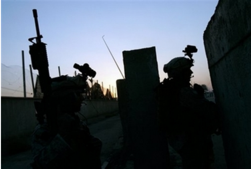
U.S. Marines patrol in Ramadi June 26, 2006.

REALLY BAD IDEA: NO MISSION; HOPELESS WAR: BRING THEM ALL HOME NOW