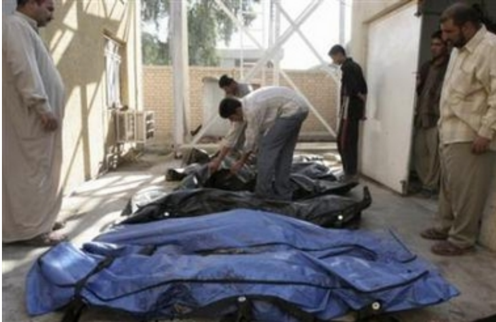
Residents identify the bodies of some of the eight people killed by a U.S. raid and air strike in Baquba, northeast of Baghdad, September 27, 2006.