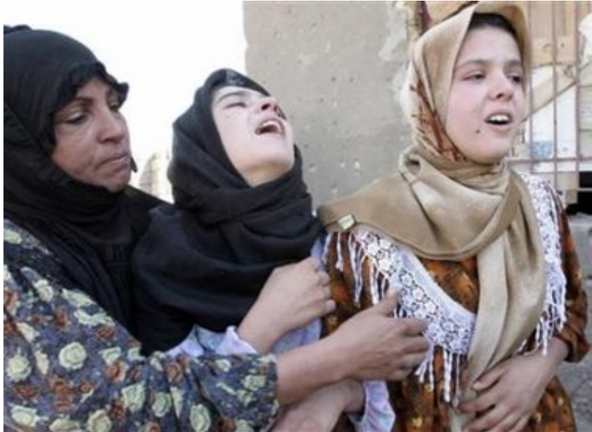
Women after seeing the bodies of their relatives who were killed by a U.S. air strike in Baquba September 27, 2006.