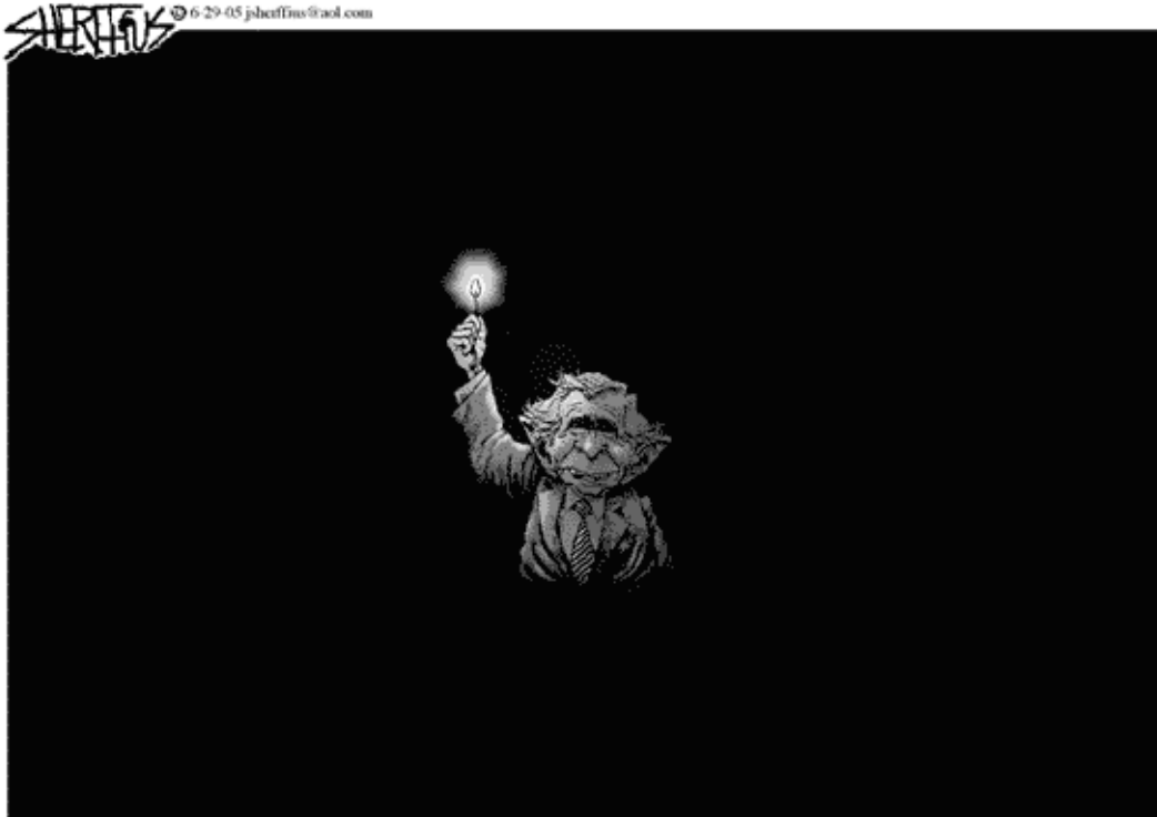
“Stay The Course”

“I Am Devastated. Feel I Need The Truth”