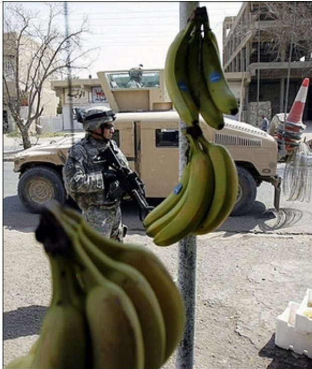
US soldiers patrol the Baghdad neighborhood of Ameriyah on 28 August 2006.