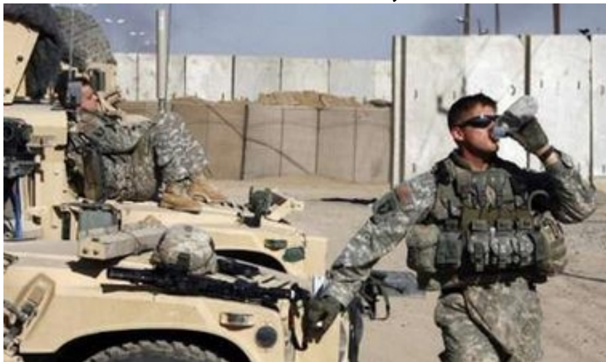
U.S. soldiers with 3rd Platoon, Alpha Company, I-327th Infantry 1st Brigade Combat Team, 101st Airborne Division Air Assault, in Bayji November 26, 2007.