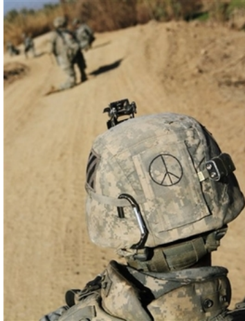
U.S. Army soldier, Bejjia village, Iraq Feb. 4, 2008.