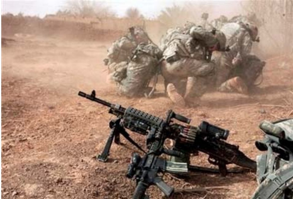
U.S. Army soldiers from 30 th Infantry Regiment brace themselves as a helicopter lands in Beijia village in Arab Jabour, south of Baghdad Jan. 30, 2008.