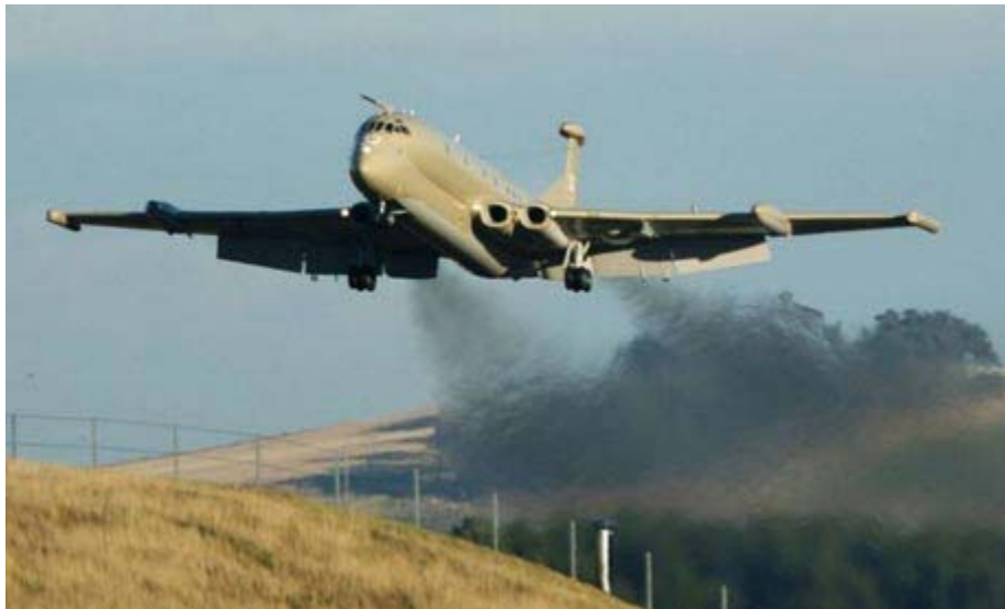
A Nimrod that hasn't crashed yet landing at RAF Kinloss.