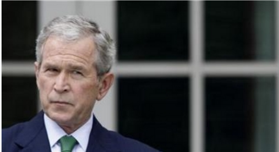
The White House in Washington, April 29, 2008.