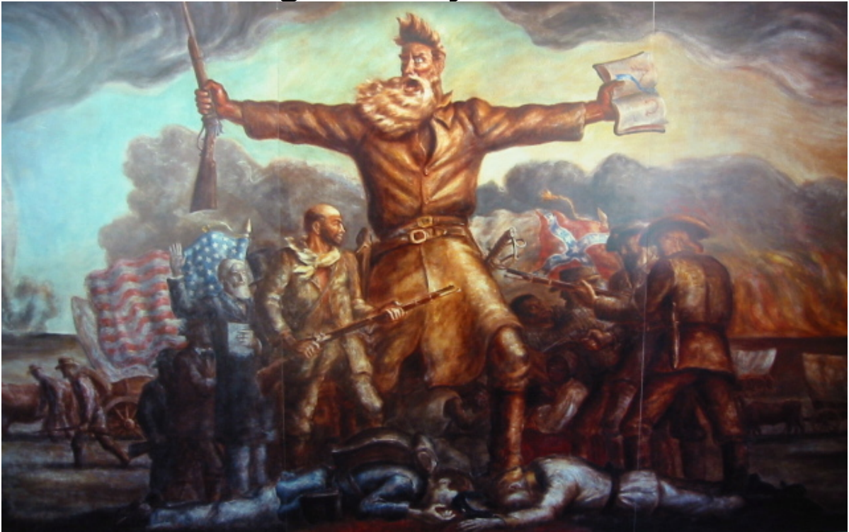
Mural by John Steuart Curry (1937-1942)