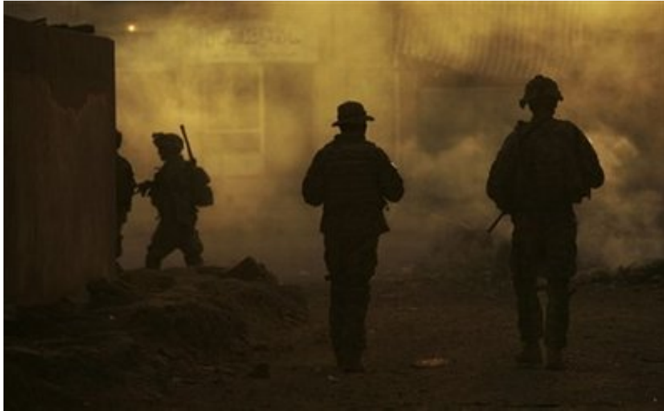
U.S. Army soldiers from 2nd Stryker Cavalry Regiment with their replacements from 25th Infantry Division in Baqouba, Iraq, Oct. 6, 2008.