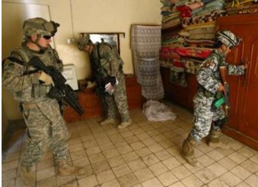
Foreign occupation soldiers from the U.S. soldiers search a house during an armed home invasion raid in Baghdad's Ameen district October 14, 2008.

[There's nothing quite like invading somebody else's country and busting into their houses by force to arouse an intense desire to kill you in the patriotic, self-respecting civilians who live there.