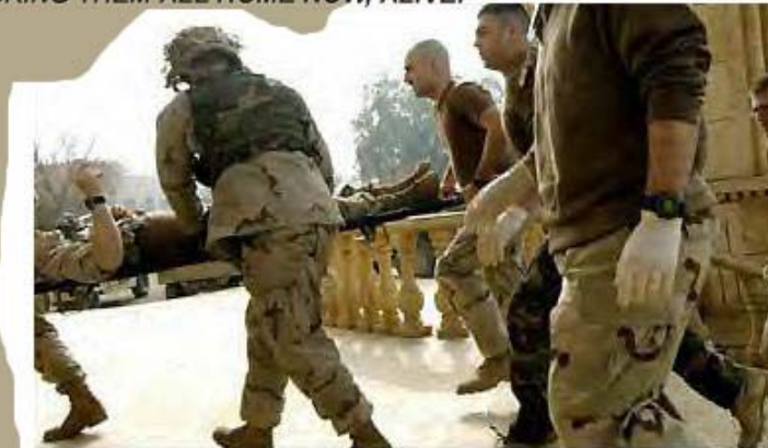
GI Special is a near-daily news bulletin for service members www.militaryproject.org

This is how Bush brings the troops home, BRING THEM ALL HOME NOW, ALIVE.