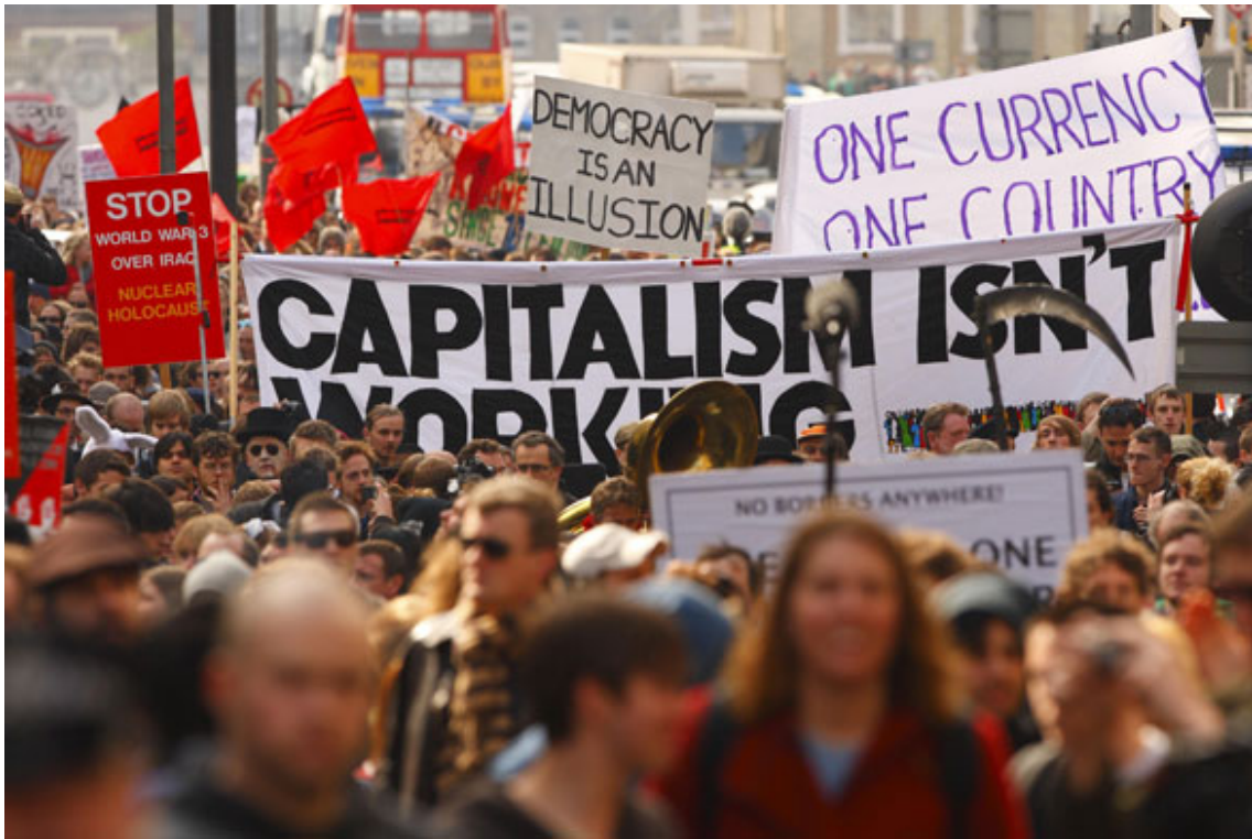
4.1.09: Protesters march near London Bridge: Photograph: Chris Ison/PA [Thanks to JM, who sent this in.]

carried signs with slogans such as “Make Love Not Leverage” and wrote graffiti on the walls of the Bank of England, including “People will stop robbing banks when banks stop robbing people.”