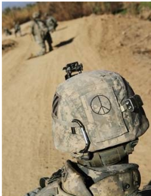
U.S. Army soldier in Beijja village in Arab Jabour, south of Baghdad.

September 6, 2009 10 AM – 6 PM Savannah, GA 31401