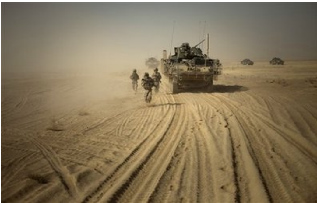
U.S. soldiers from the 5th Stryker Brigade during a patrol along the border with Pakistan, on the outskirts of Spin Boldak, Afghanistan, Aug. 7, 2009.