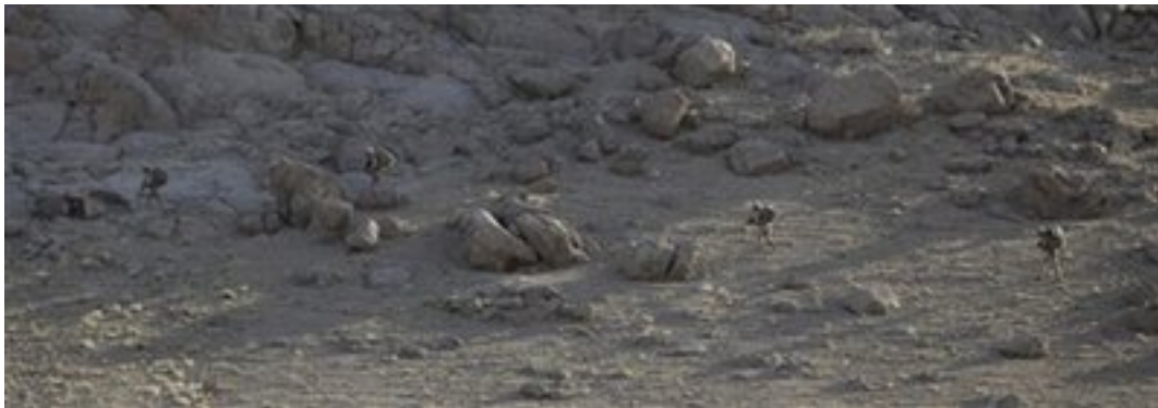
U.S. Marines just outside the village of Dahaneh Aug. 12, 2009, in the Helmand Province of Afghanistan.