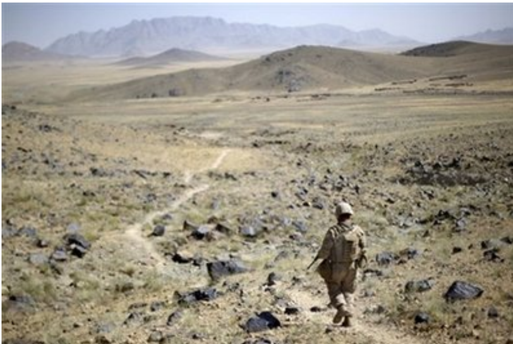
U.S. Marine from 3rd Marines walks down from an observation post near Now Zad in Afghanistan's Helmand province, June 19, 2009.