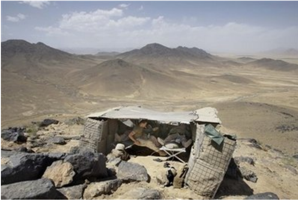
U.S. Marines from the 3rd Marines at an observation post near Now Zad in Afghanistan's Helmand province June 19, 2009.