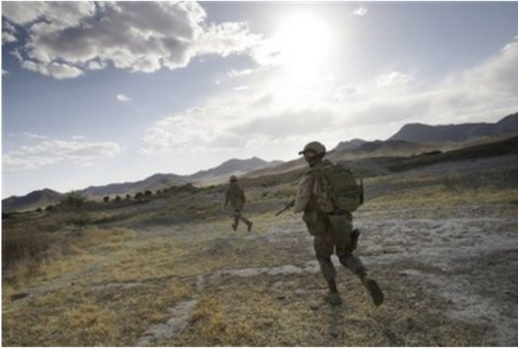
U.S. Marines from the 3rd Marines run d towards their vehicles as they battle Taliban fighters near Now Zad in Afghanistan's Helmand province, June 20, 2009.