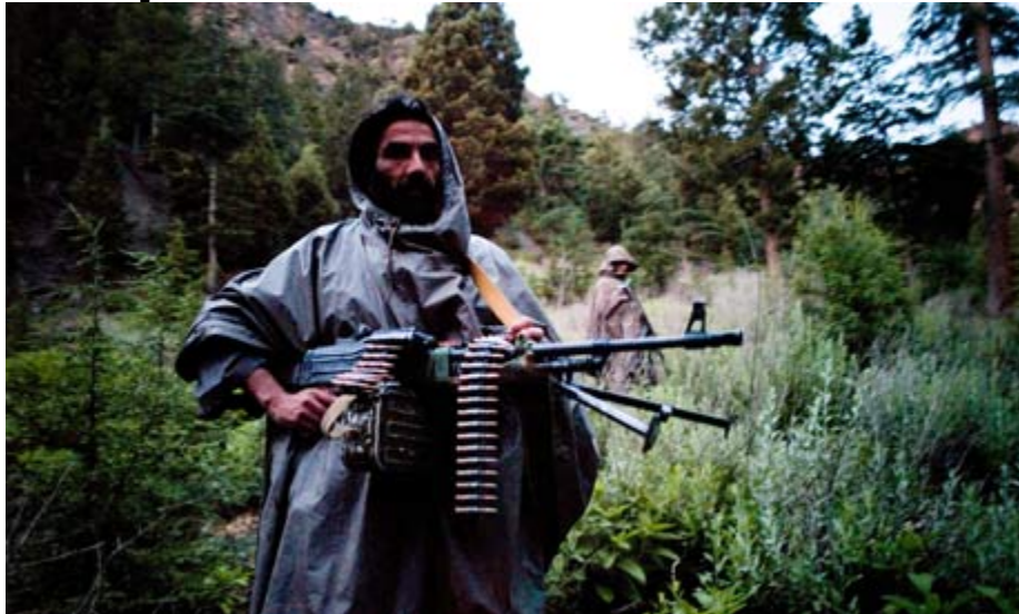
A Taliban fighter loyal to Jalaluddin Haqqan.

“The Taliban Don’t Hide, They Live With The People” “We Average Two Or Three Attacks A Day Against The Americans And Their Allies” “The More Troops They Send, The More Targets We Have, So It’s Good” “The Foreign Troops Are Non-Muslims And There Was No Referendum From The People To Ask Them To Come Here”