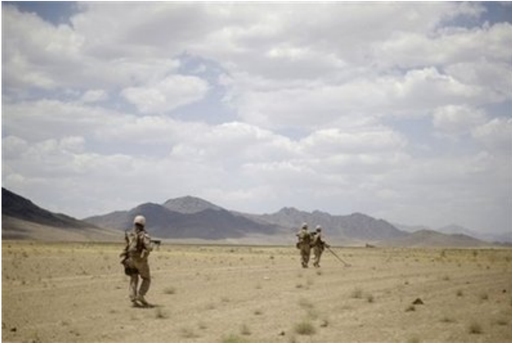
U.S. Marines from 3rd Marines walk to their base near Now Zad in Afghanistan's Helmand province, returning from a patrol to the village of Khwaja Jamal June 22, 2009.