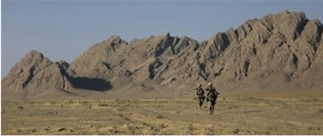
Marines with 2nd MEB, walk toward the village of Khaji Jamal during a patrol Aug. 9, 2009, in the Helmand Province of Afghanistan.