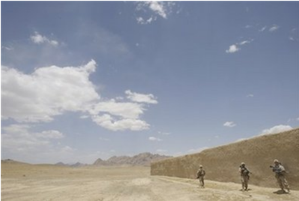
June 22, 2009: U.S. Marines from the 3rd Marines in the village of Khwaja Jamal near their base near Now Zad in Afghanistan's Helmand province.