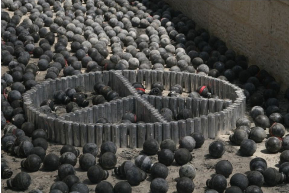
An exhibition of spent tear gas grenades and projectiles in the village of Bil'in for which Abu Rahmah was indicted on.

December 23, 2009 Popular Struggle Coordination Committee