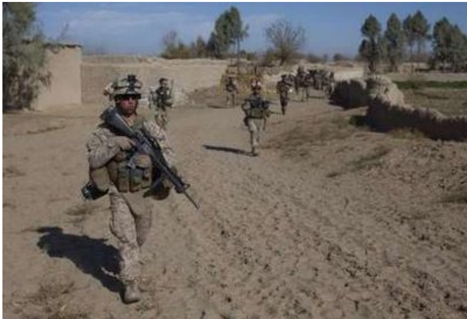
U.S. Marines from Camp Lejeune, North Carolina, patrol through Garmsir district of Helmand Province December 18, 2009.