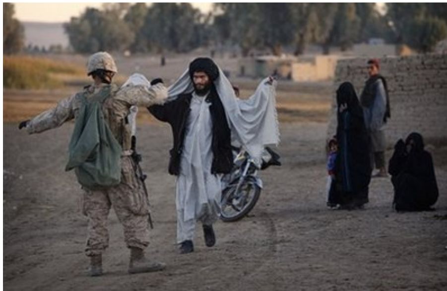
A marine from the USA publicly humiliates an Afghan citizen after stopping him at gunpoint in the Garmsir district, Helmand province, southern Afghanistan, Dec. 18, 2009.