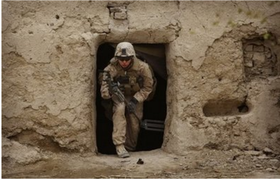
A United States Marine leaves a Afghan citizens' house after searching it in Khan Neshin in the province of Helmand, Afghanistan, Dec. 8, 2009.