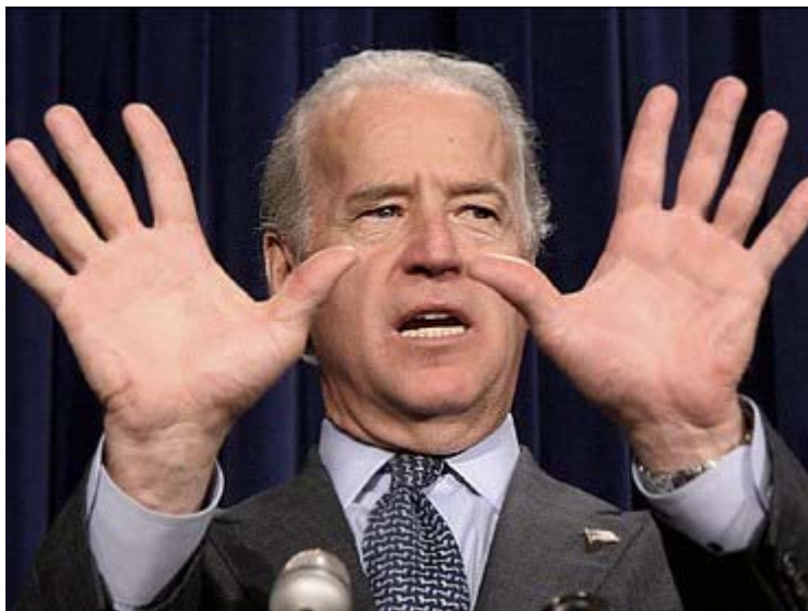
Lying, betraying bottom-feeding scum-sucker