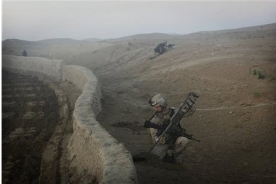
United States Marines search for explosives in the Garmsir district of Helmand province, southern Afghanistan, Dec. 23, 2009.