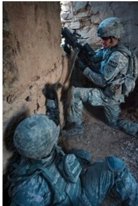
Dec 2: US soldiers take cover at an abandoned house in eastern Afghanistan.