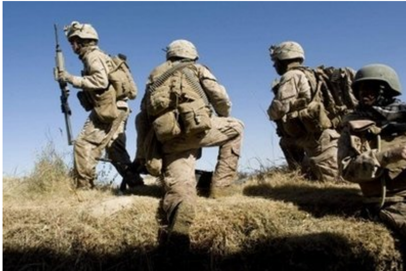
Nov 26: US Marines come under fire as they return to base following a search operation in Mian Poshteh in Helmand Province, Afghanistan.