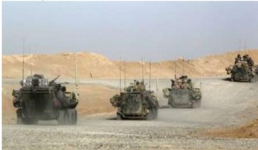
U.S. Marines from First Light Armoured Reconnaissance unit leave Combat Outpost Payne aboard armoured vehicles for a mission in Helmand September 6, 2010.

THE UNDOUBTED SUCCESS OF THE U.S. MILITARY EFFORT MAY BE SEEN HERE, SHOWING THE VAST QUANTITIES OF AFGHANISTAN THAT HAVE BEEN LIBERATED, AND WILL FORM THE BASIS FOR A NEW, FREE, DEMOCRATIC AFGHAN SOCIETY