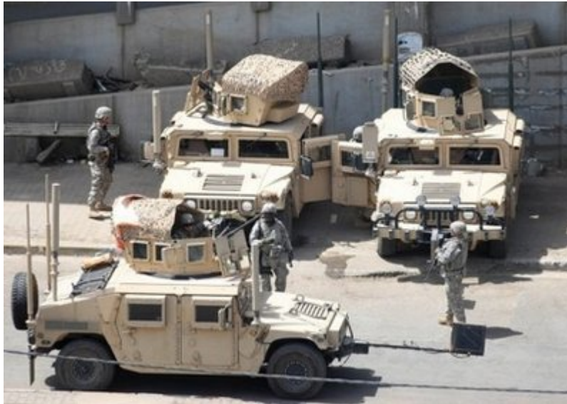
US soldiers are seen parked up close to the Baghdad Governorate building on September 8.