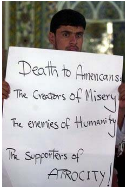
An Afghan holds a poster at a demonstration against the United States north of Kabul, Afghanistan, Sept. 9, 2010.