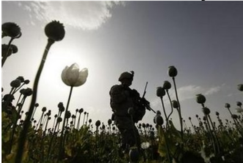
A soldier from the U.S. Army's 2nd Platoon, Alpha Troop, 2-1 Infantry Battalion, 5/2 Striker Brigade Combat Team walks through an opium poppy field during an operation in the Arghandab River Valley in Kandahar Province April 15, 2010.