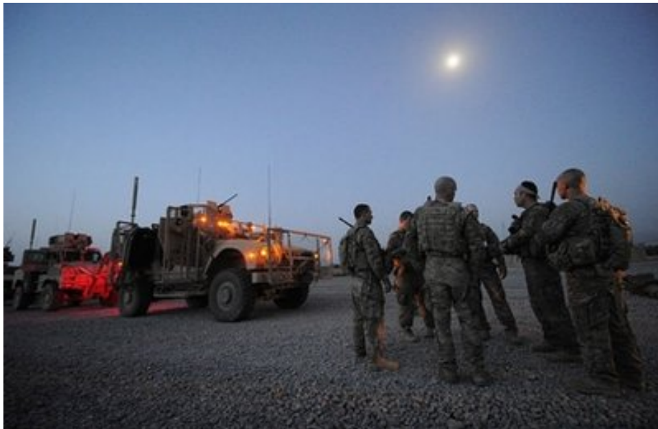
US soldiers from Viper Company (Bravo), 1-26 Infantry hold a briefing prior to a patrol at Combat Outpost (COP) Sabari in Khost province in eastern Afghanistan early on June 19.

IF YOU DON'T LIKE THE RESISTANCE END THE OCCUPATION