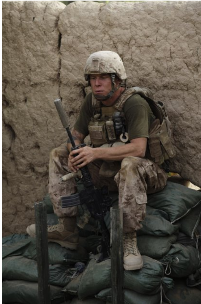
Aug. 27, 2011: A U.S. Marine, 3/4 Marines, after an exchange of fire with Taliban militants in the Gesresk Valley, Helmand province, southern Afghanistan. Militants regularly attack the base from multiple directions using launched grenades, sniper rifles, and AK-47s.