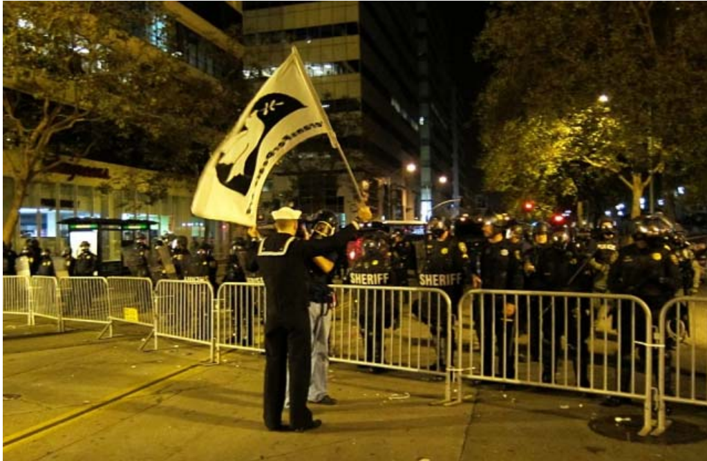
Oct 26th, 2011